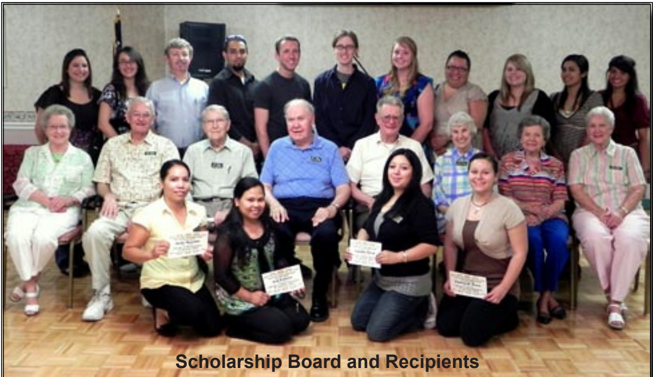
Scholarship Board and Recipients

Each year The Resident Scholarship Board awards scholarships and educational grants to hourly staff members who wish to further their education. Each spring The Scholarship Board sends out a letter explaining the program and extends an opportunity for each resident to contribute to the fund. Several fundraisers are also held each year including our famous Super Bowl Chili Bowl event. Last year nearly $32,000 in Village scholarships was awarded!