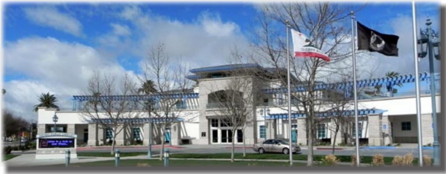
Hemet Public Library - 300 E. Latham Ave., Hemet, CA